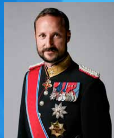
His Royal Highness Crown Prince Haakon is patron of ISAM 2011 Oslo