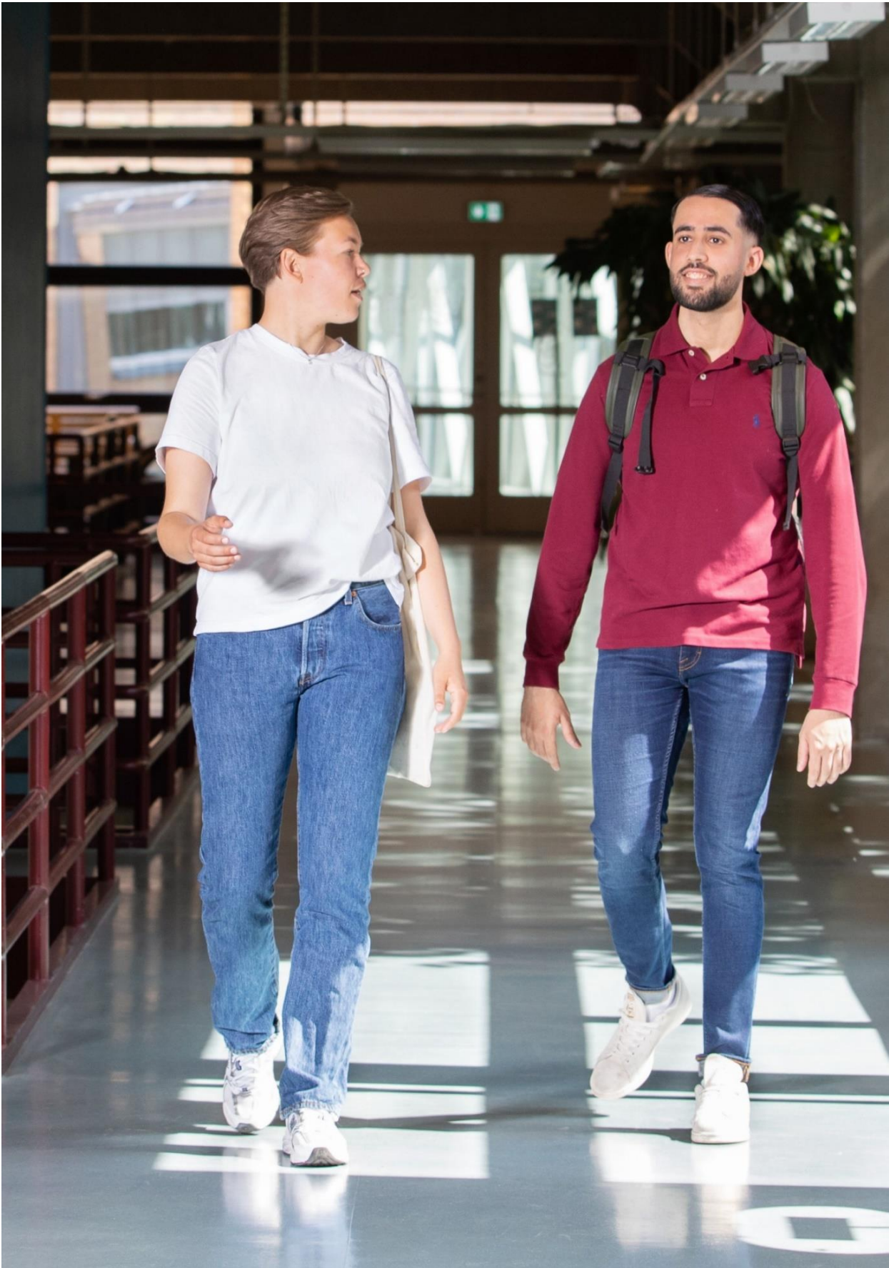
Students at Domus Medica.