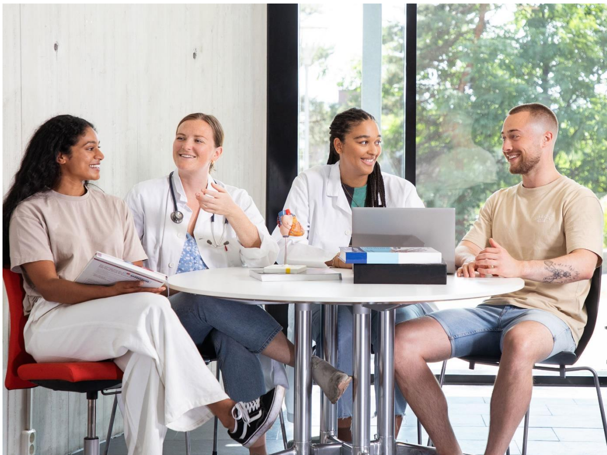
Students at Cafe Eric.