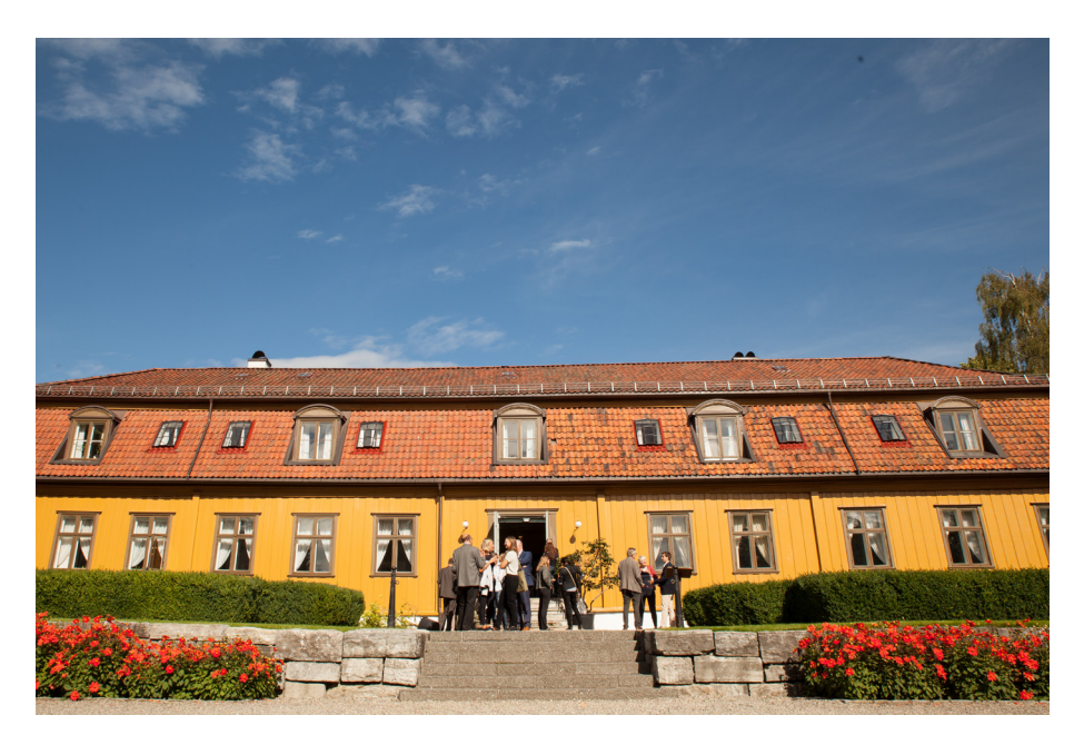
Networking lunch at the University of Oslo's Botanical Gardens