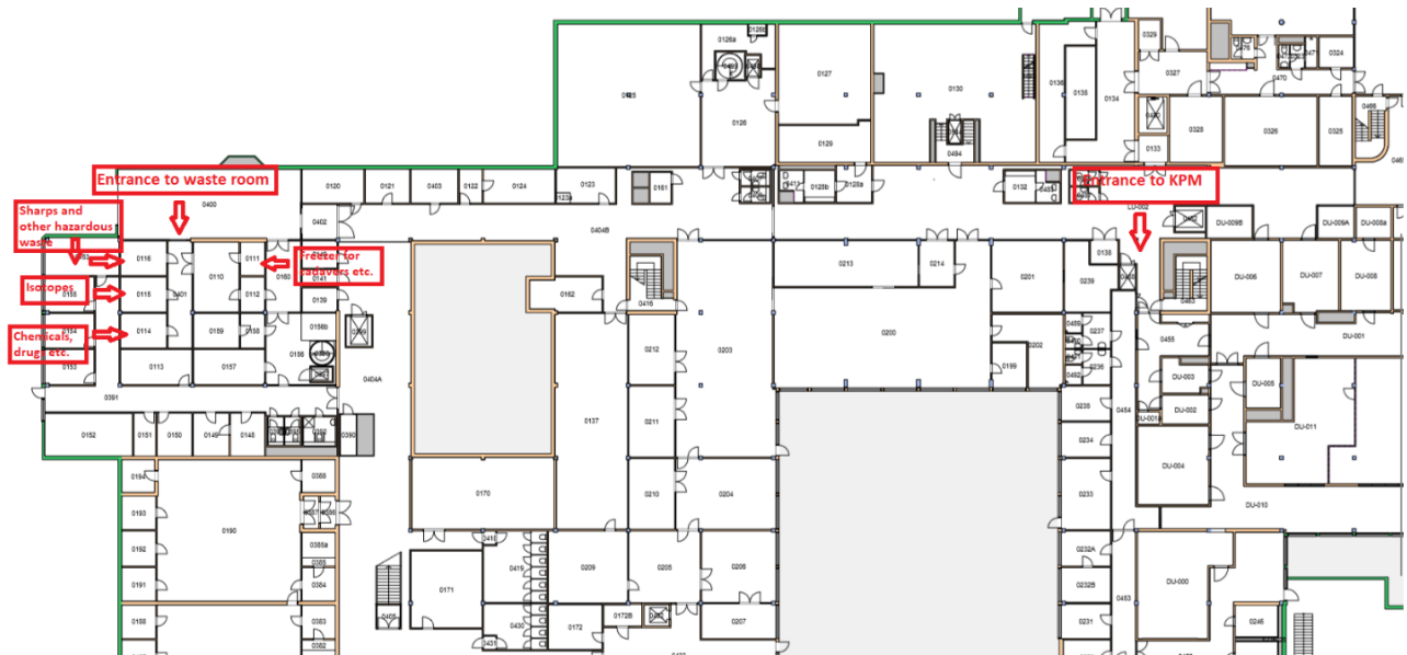
Illustration 1: Waste room for hazardous waste etc.