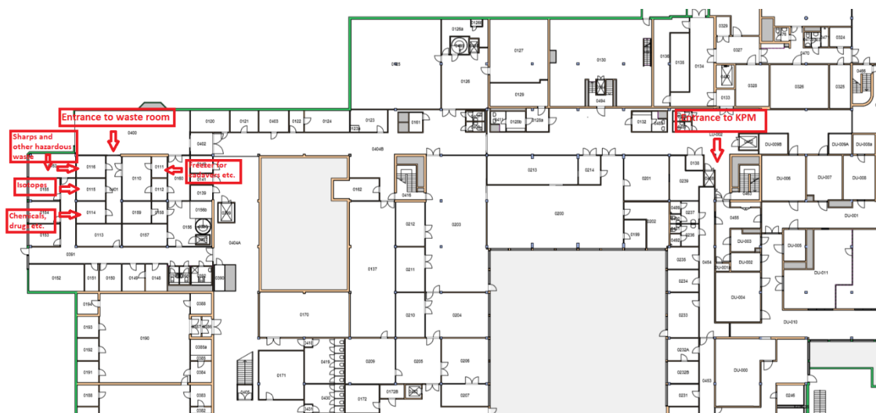
Illustration 1: Waste room for hazardous waste etc.

https://kilab.no/produkter/kategori/avtrekkskap/