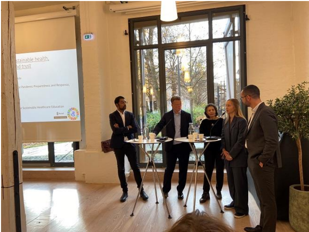
Oslo SDG Conference.

SHE-affiliated students have been responsible for a range of events and activities. The maybe most high-profile activity was the Student Conference on health and sustainability which took place on 9 th September 2022. The conference was cross-disciplinary and cross-sectoral, and brought together academics, policy makers and high-level public health professionals to discuss topics including food security and climate challenges. Another key event was the Climate and Health Week («Klima og helse-uken»), organised by SHE student leaders in collaboration with the association of Norwegian Medical Students. The event, consisting of a workshop on climate and health and a subsequent panel discussion, was live streamed and reached a nation-wide audience of medical and health care students. SHE-affiliated students also held presentations and participated in panels and debates in a variety of fora including Arendalsuka, organized the UN Day 2022 seminar on how climate change affects health services in collaboration with the UN Student Association, and were involved in a number of other events (see Appendix 4).