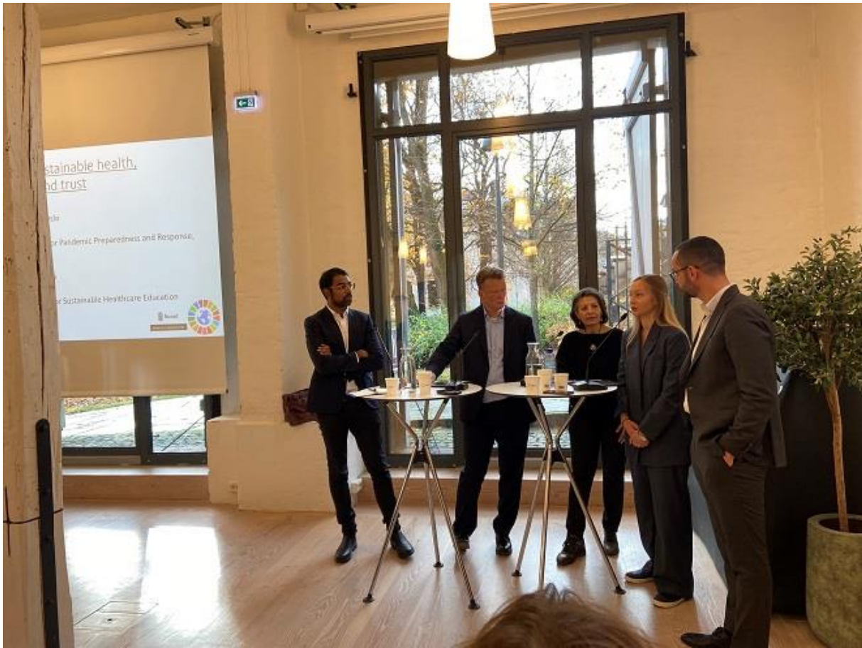
Oslo SDG Conference.

SHE-affiliated students have been responsible for a range of events and activities. The maybe most high-profile activity was the Student Conference on health and sustainability which took place on 9 th September 2022. The conference was cross-disciplinary and cross-sectoral, and brought together academics, policy makers and high-level public health professionals to discuss topics including food security and climate challenges. Another key event was the Climate and Health Week («Klima og helse-uken»), organised by SHE student leaders in collaboration with the association of Norwegian Medical Students. The event, consisting of a workshop on climate and health and a subsequent panel discussion, was live streamed and reached a nation-wide audience of medical and health care students. SHE-affiliated students also held presentations and participated in panels and debates in a variety of fora including Arendalsuka, organized the UN Day 2022 seminar on how climate change affects health services in collaboration with the UN Student Association, and were involved in a number of other events (see Appendix 4).